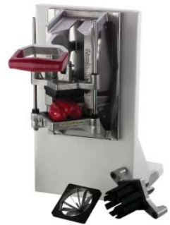
3.5W shown with optional accessories